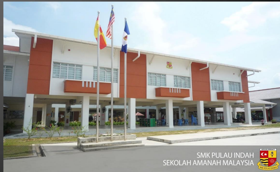
SMK PULAU INDAH