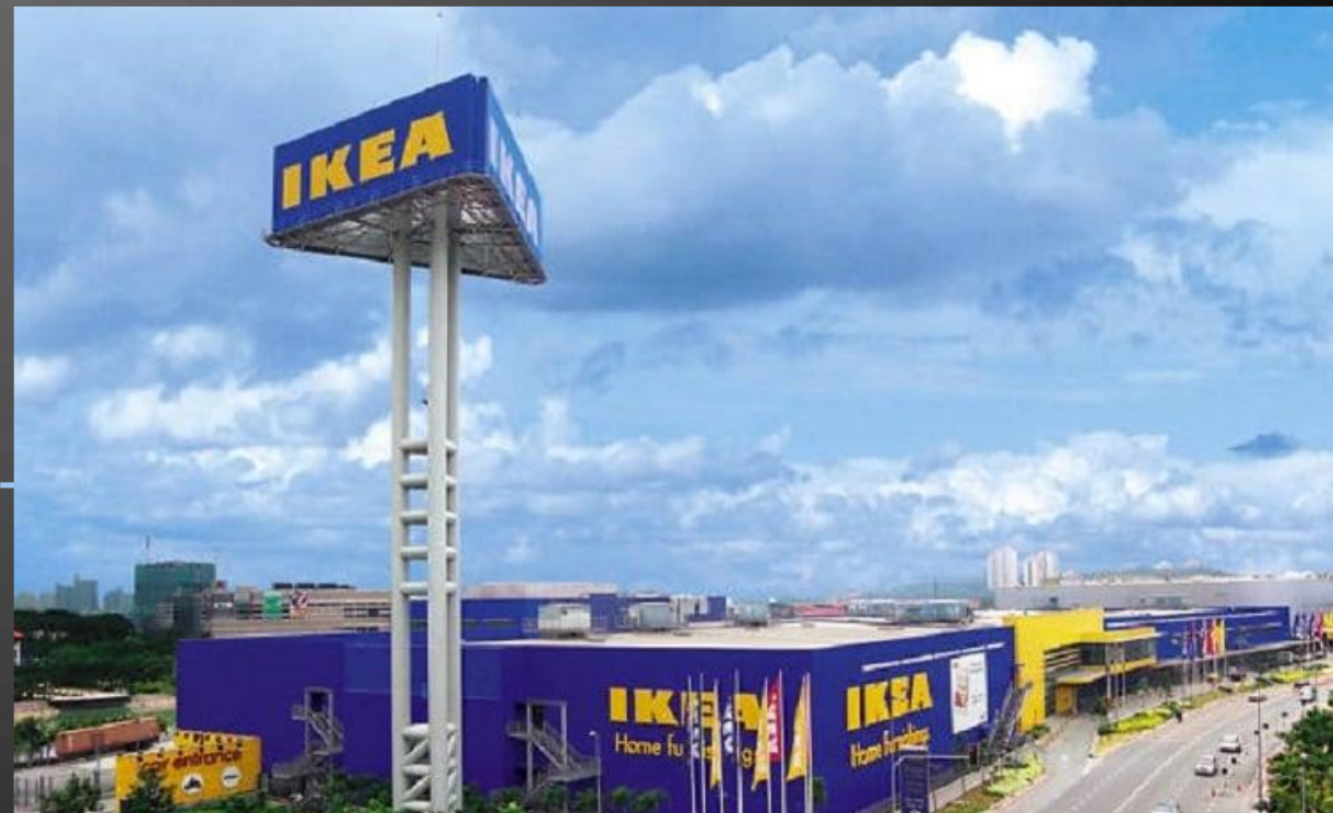
IKEA (COMING SOON)