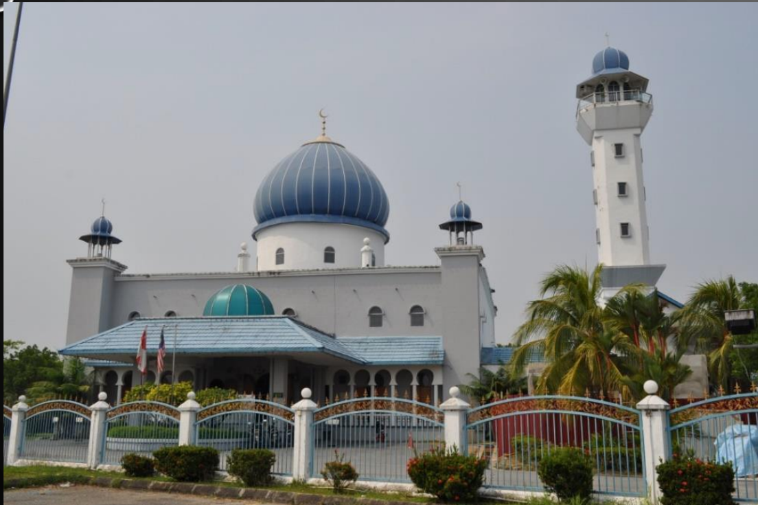
MASJID SULTAN ABDUL AZIZ