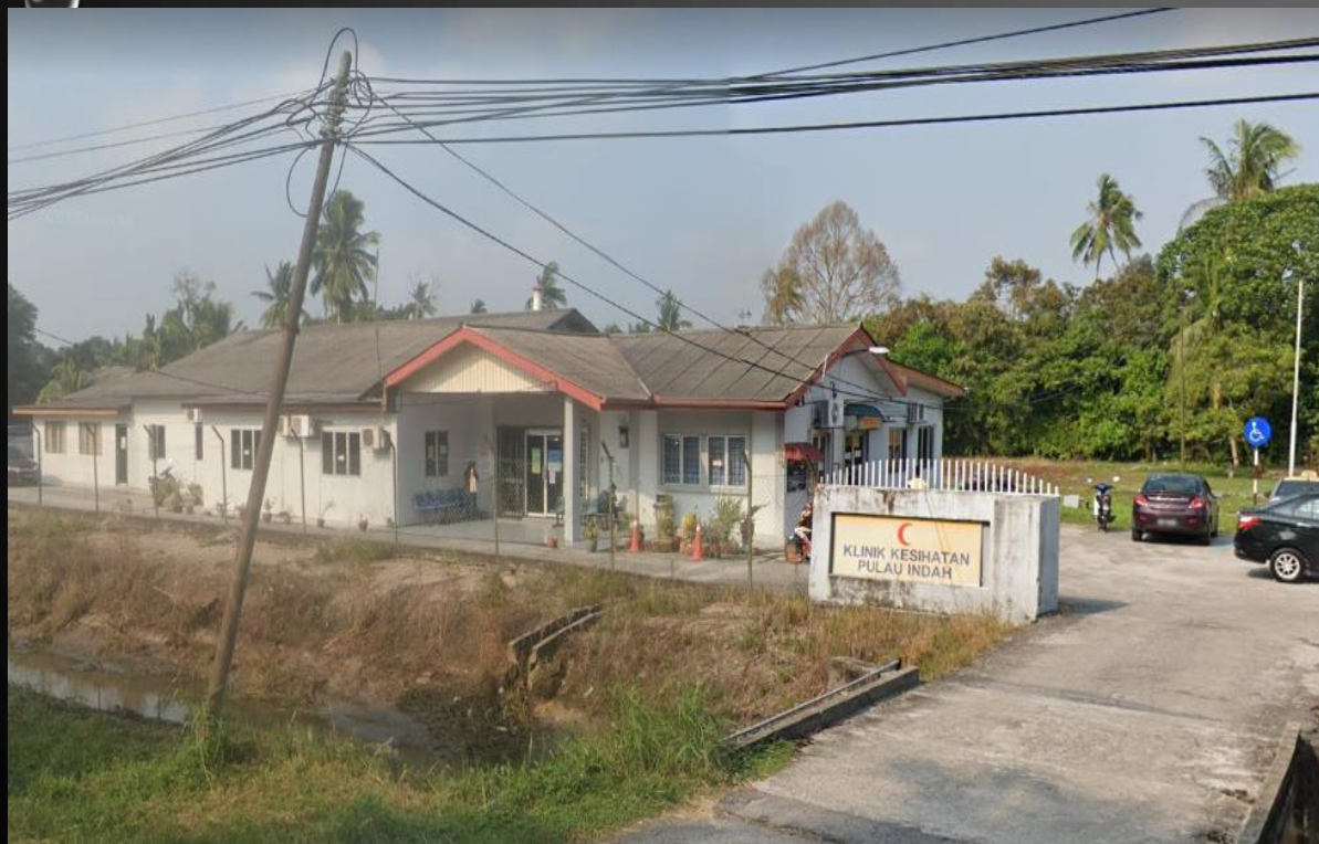
KLINIK KESIHATAN PULAU INDAH