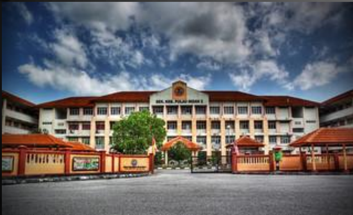
SK PULAU INDAH 1 & 2