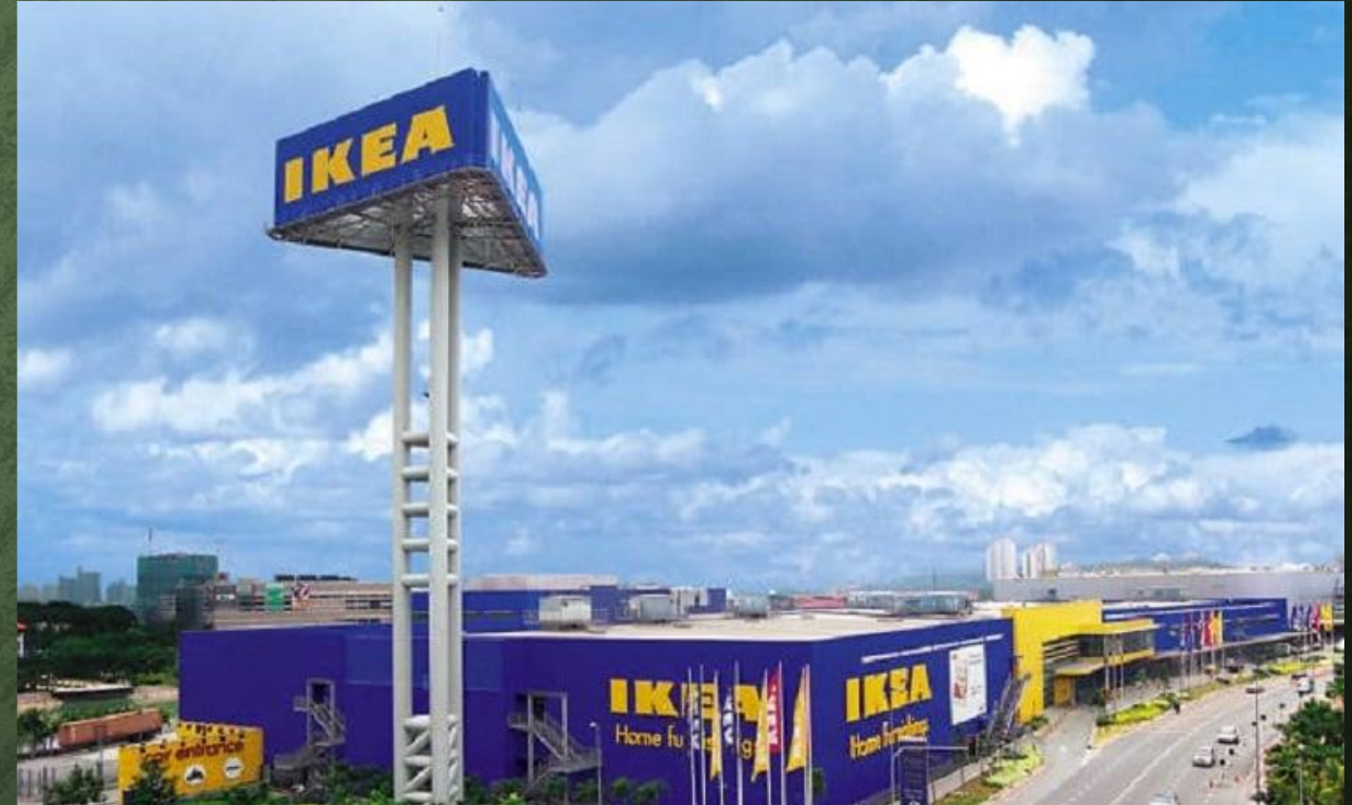
IKEA (COMING SOON)