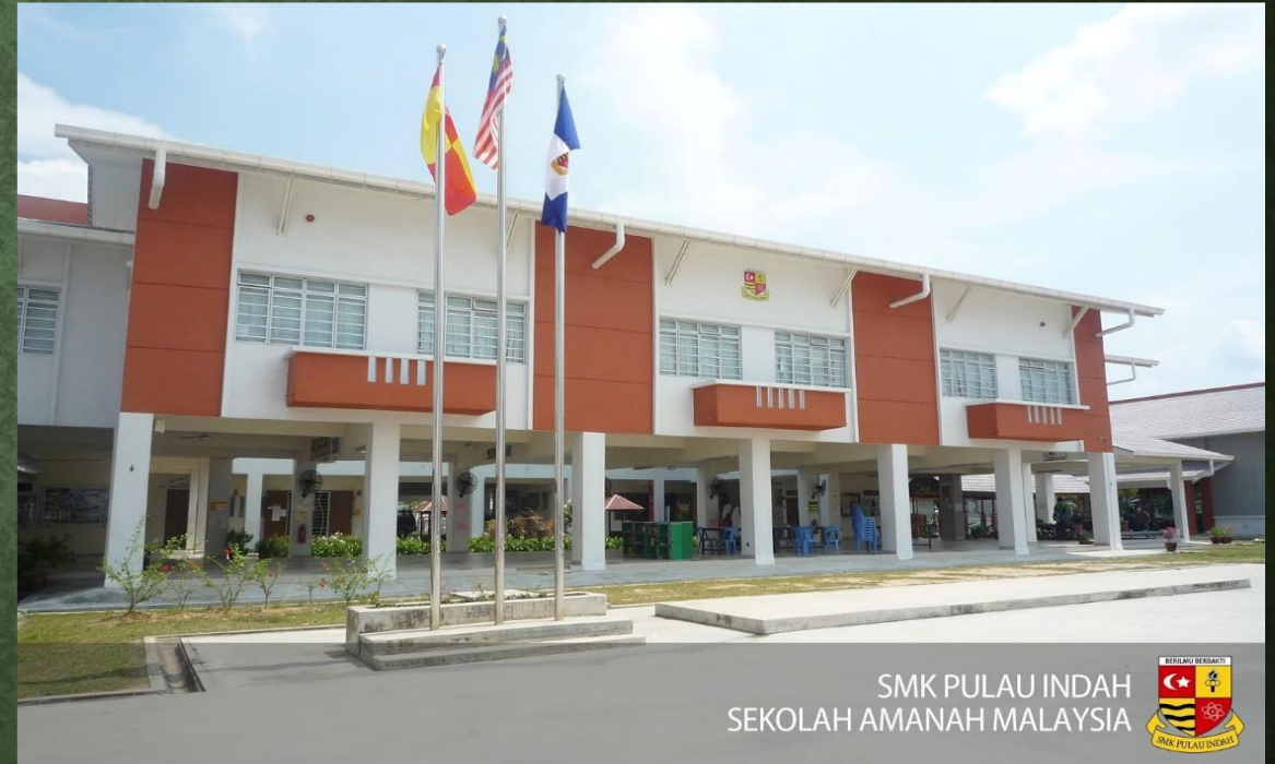
SMK PULAU INDAH SEKOLAH AMANAH MALAYSIA