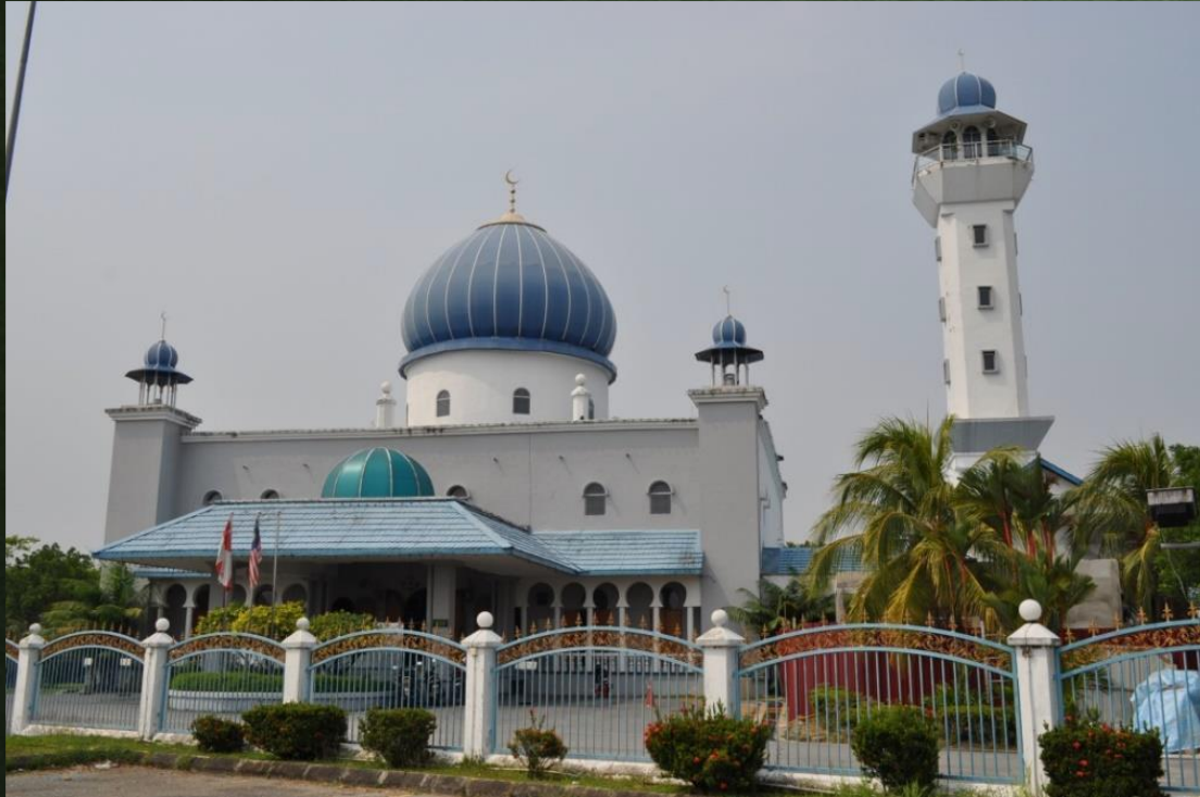
MASJID SULTAN ABDUL AZIZ