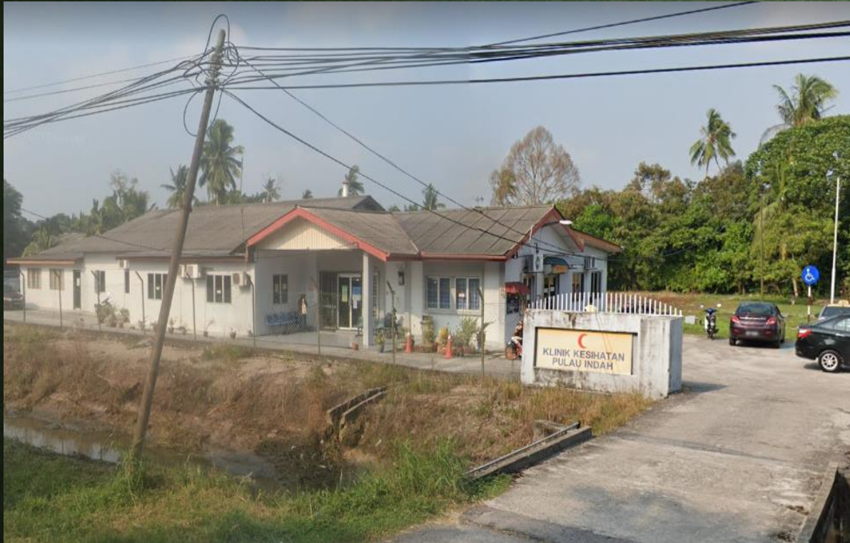
KLINIK KESIHATAN PULAU INDAH